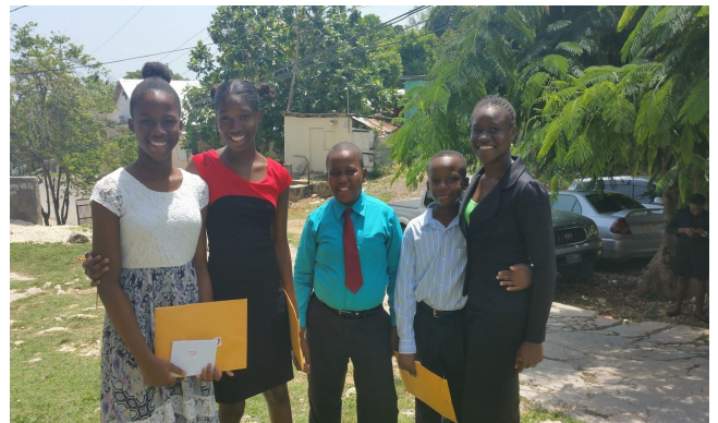
Barrett Town and Mt. Salem scholarship recipients in 2017